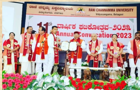
Convocation at RCU, University Rank Holder