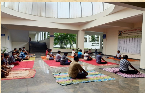
Yoga Day Celebration