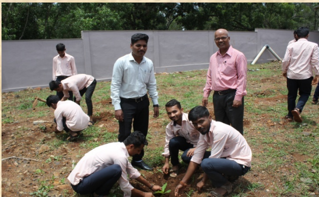
World Environment day Celebration