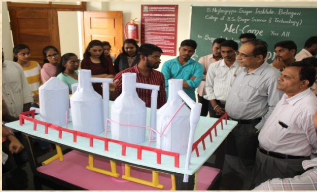
Workshop on Model Exhibition