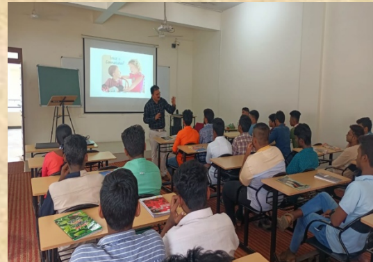
IoT enabled Classroom